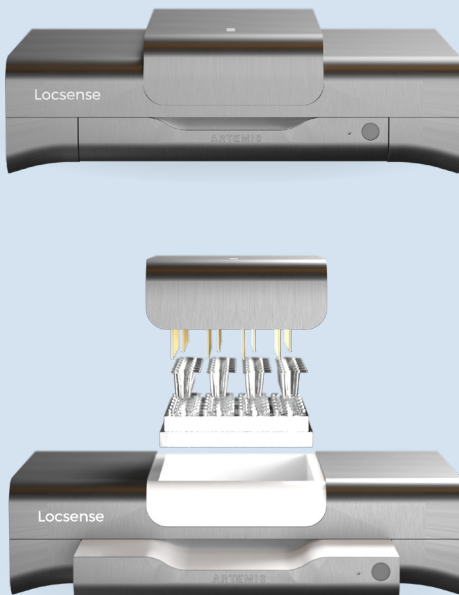
Table 1 | Specifications